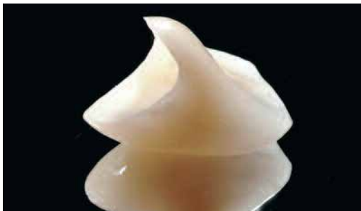
Figs 11a and 11b Finished refractory-die-generated porcelain jacket crowns and veneer.